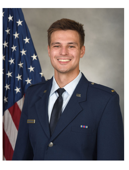
Lakeville, MN T-38C Talon