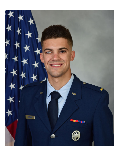
Winona Lake, IN T-1 Simulator