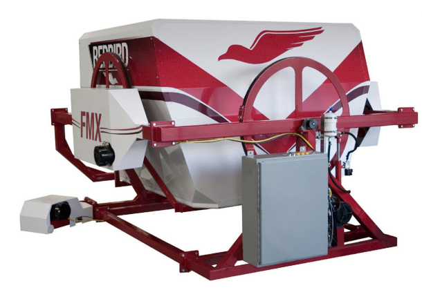
Sarasota, FL T-1 Simulator